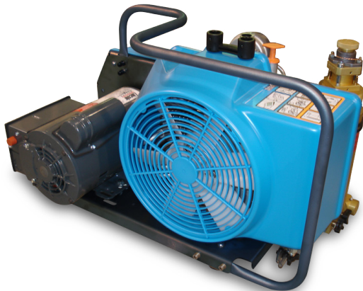
› ELECTRIC DRIVE