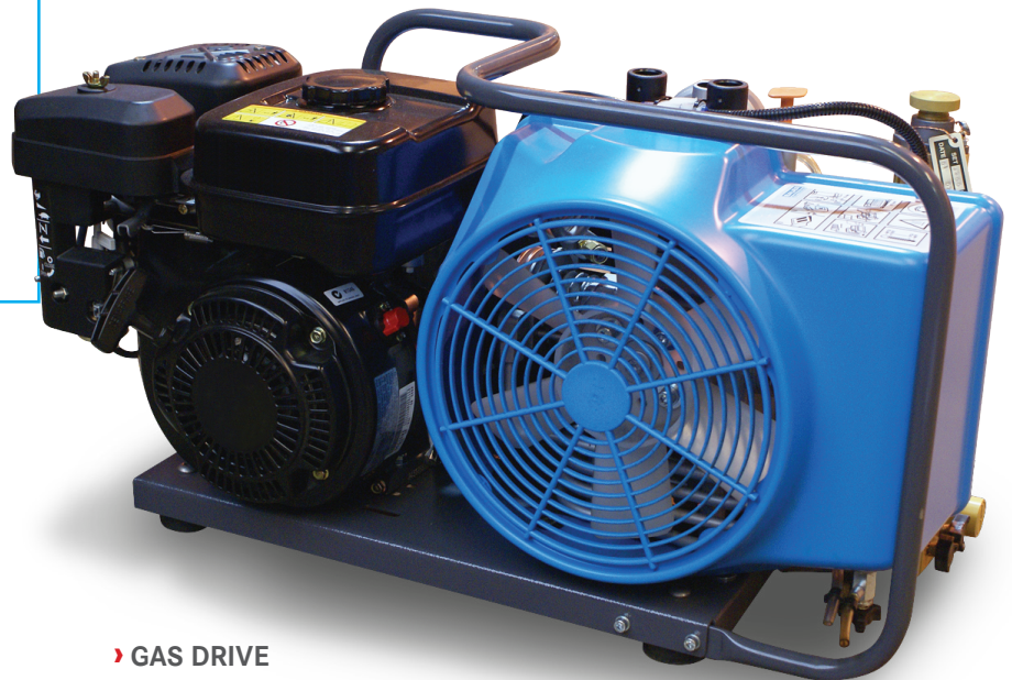
› GAS DRIVE